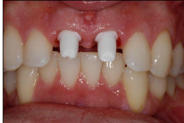
Custom abutments seated in patients mouth