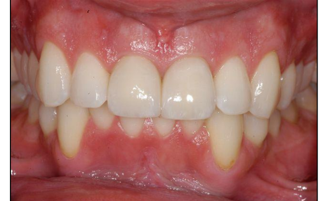
Final restorations in place