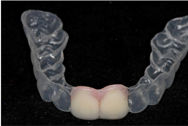
Essex Appliance for temporary replacement of missing teeth