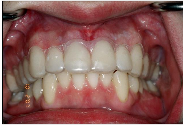
Essex Appliance for temporary replacement of missing teeth