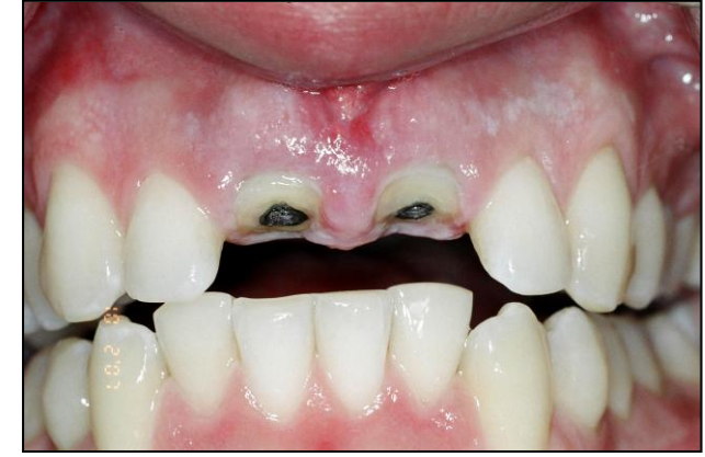
Customized healing abutments placed on implants to support gingival contours