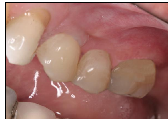
Final three-tooth dental implant restoration