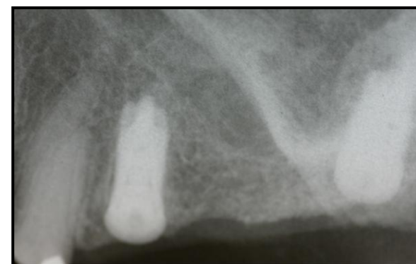
Radiograph of dental implants