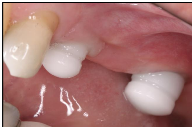
Temporary healing caps snapped over abutments