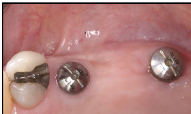
Dental implants placed after extraction sockets have healed